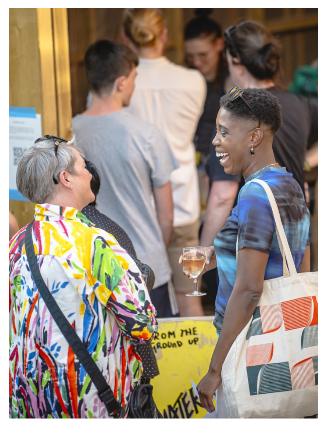
Primary Re-opening event.

We expect all Board members to actively contribute to our work around Equity, Diversity & Inclusion, and support Primary in becoming a socially just organisation.