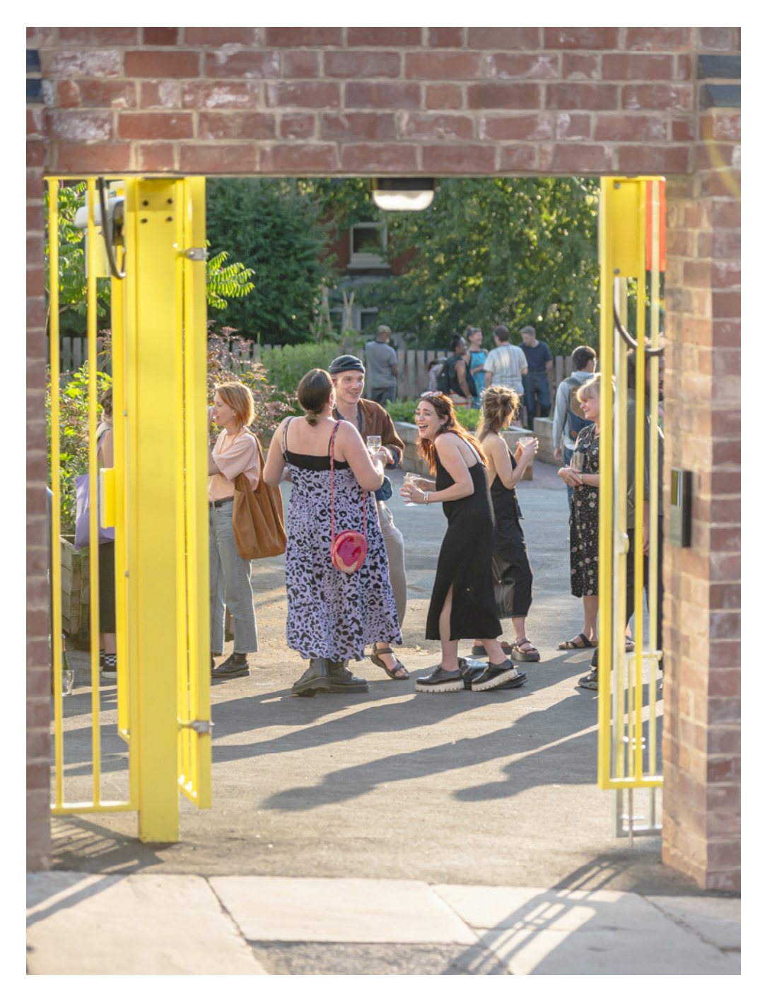
Primary Re-opening event.