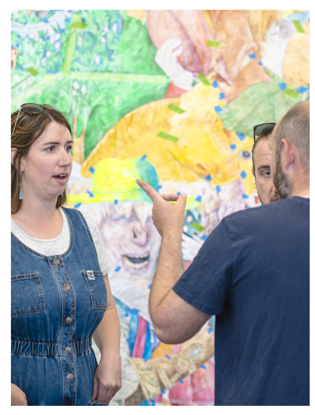
Primary Re-opening event.