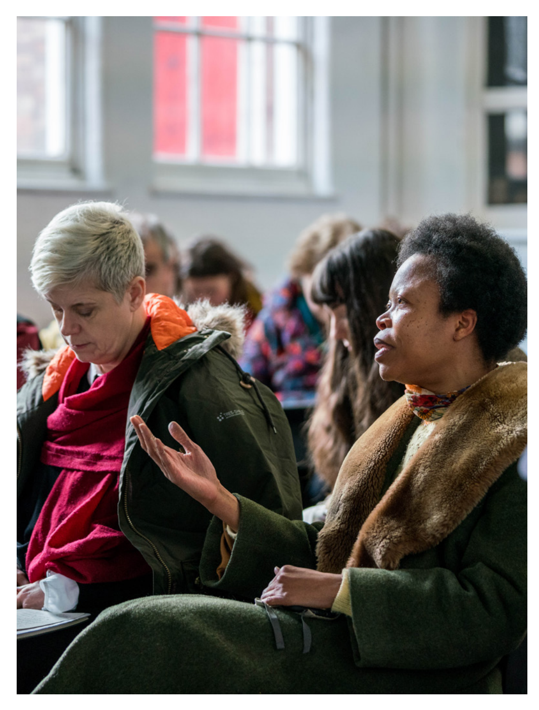
Arts and Place: Nottingham